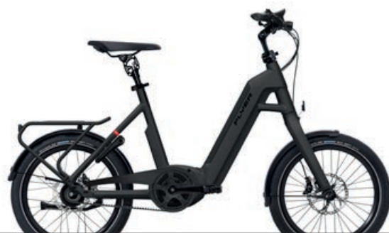
Upstreet1 743 Black Matt

Perfectly adapted for an urban lifestyle, the Upstreet1 displays its true greatness in confined spaces. With its compact dimensions and refreshing design, this extraordinary e-bike combines urban mobility with riding fun. Despite its compact 20-inch wheels and agility, the Upstreet1 boasts an astoundingly high level of riding stability, and with the riding comfort expected of FLYER, is convincing over long distances, too. The whisper-quiet Bosch drive allows the speedster for around town to ride through urban areas almost silently. And through all this, the Upstreet1 remains faithful to the "one for all" motto: this one-size e-bike is suitable for anyone who is 150 to 190 centimetres tall. The Upstreet1 offers agile mobility for any situation.