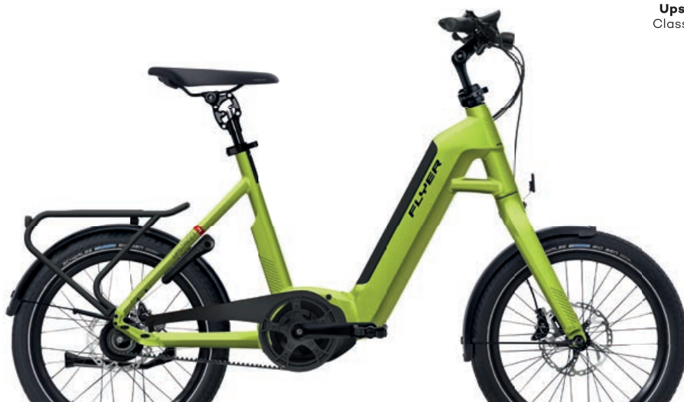
Upstreet1 743 Lime Green Gloss

The product images shown in this catalogue may differ from the specifications. Colours may differ.