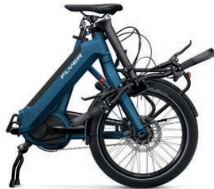
Upstreet2 5.00 Folded: 93 x 85 x 40 cm

Whether you are on a camping trip or on your daily commute by train, the Upstreet2 comes into its own when space is at a premium. The compact folding bicycle does not have to make any concessions in terms of its riding performance: thanks to its clever folding hinge with double protection and its stable frame, the Upstreet2 provides astonishing riding stability and comfort. The agile 20-inch wheels and the smooth Bosch drive guarantee dynamic riding enjoyment. And through all this, the Upstreet2 remains faithful to the "one for all" motto: this one-size e-bike is suitable for anyone who is 150 to 190 centimetres tall. There are truly limitless opportunities for the small Upstreet2 to provide a great deal of additional freedom.