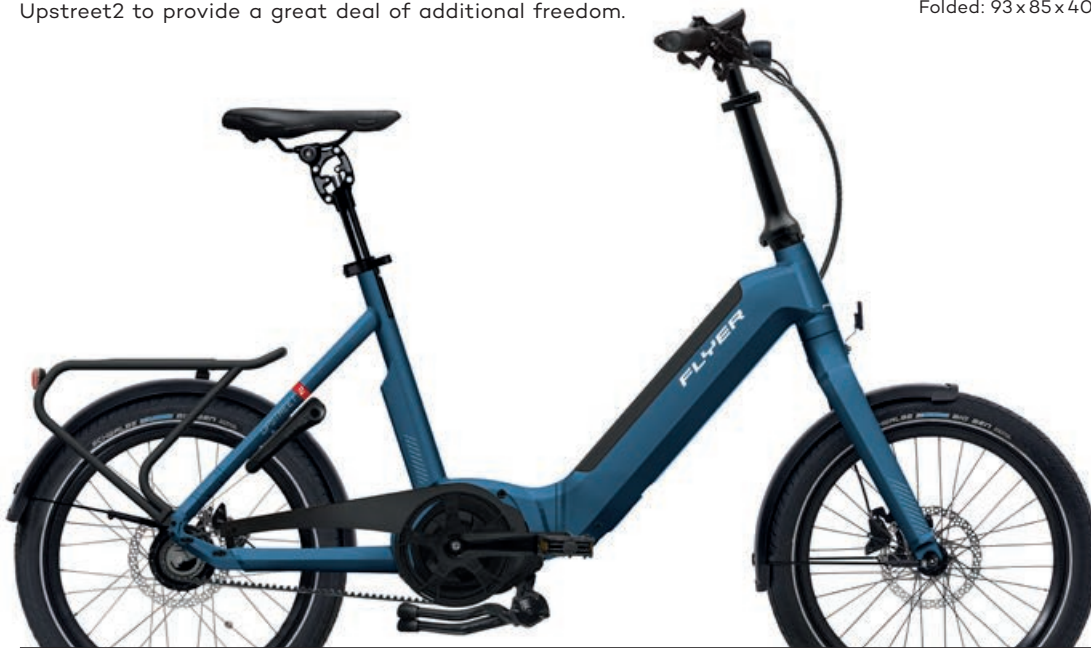
Upstreet2 7.43 Jeans Blue

The product images shown in this catalogue may differ from the specifications. Colours may differ.