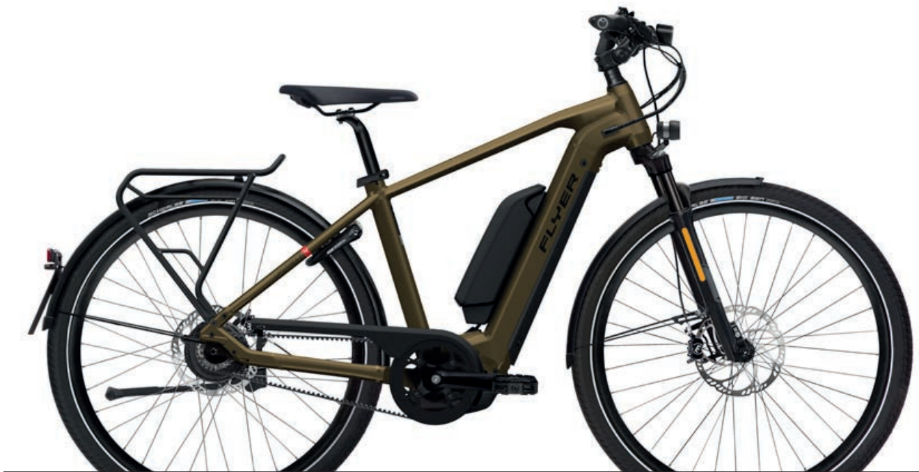
Upstreet4 7.83 Vintage Brass Gloss, Gents

The Upstreet4 just keeps on going and is the ideal companion for the urban jungle. The indefatigable long-distance e-bike not only feels good, but also makes everyone look good. With a choice of two batteries and a battery capacity of up to 1125 Wh, the sporty e-bike for commuters is setting new records in terms of range. Equipped with the most powerful Bosch drive and premium features, this first-class bike is designed for frequent riders and ambitious e-bikers. The highest level of comfort is guaranteed over long distances by the comfortable sporty seating position and the frame designed for smooth riding. The Upstreet4 is also available as a high-speed version with pedal assist up to 45 km/h for speedy commuting. Routes are never long enough for the Upstreet4.