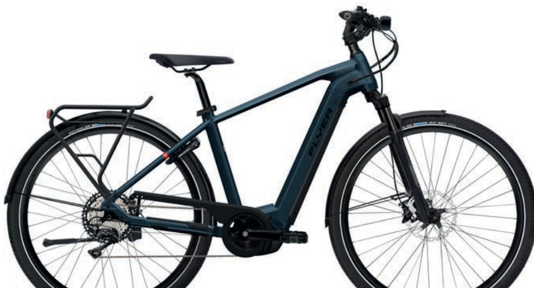
Upstreet4 770 Space Blue Gloss, Gents