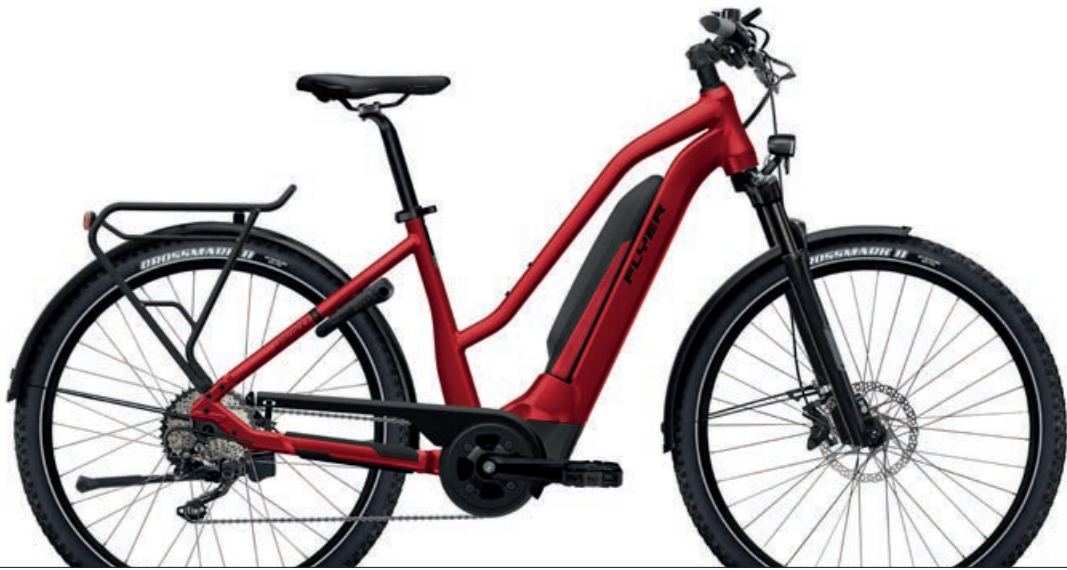
Upstreet 5 7.12 XC Mercury Red Gloss, Mixed