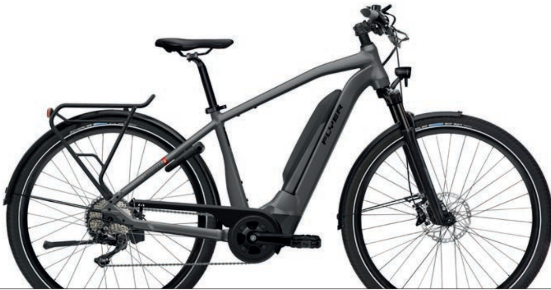
Upstreet 5 7.10 Anthracite Gloss, Gents

The product images shown in this catalogue may differ from the specifications. Colours may differ.