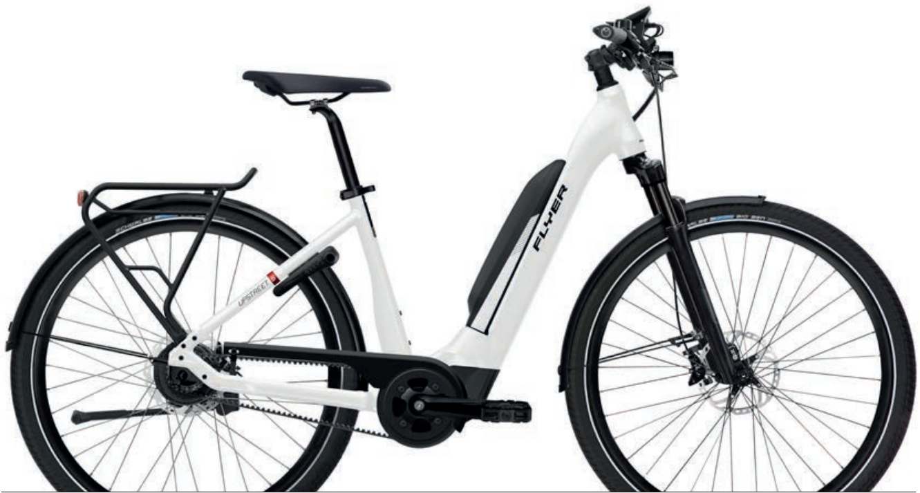
Upstreet5 7.83 Pearl White Gloss, Comfort

Whether on the road, on a quick commute, or when veering off to ride on a country track, the Upstreet5 turns e-mobility into an experience. A powerful Panasonic motor, balanced geometry and stable wheels with wide tyres guarantee riding comfort and safety. Sophisticated innovations, such as the particularly intuitive operation of the colour display and drive system – with the option of fully automatic gear shifts – and the low-maintenance belt drive, ensure unlimited riding joy. The Upstreet5 accepts no restrictions in terms of features and components. The Upstreet5 is available as a high-speed version with pedal assist up to 45 km/h and as a 7.12 XC special model with mountain bike tyres for enhanced off-road capabilities. The Upstreet5 turns everyday routine into leisure time.